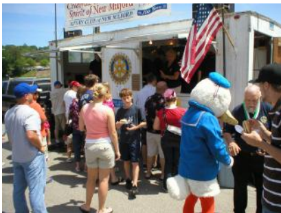
Our food crew (above and right), once again did a masterful job of satisfying the hunger of the crowd.