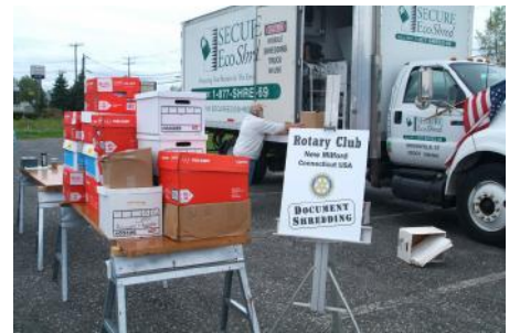
The truck gets ready to receive the early customers' boxes.