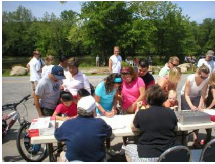
Early birds sign up to adopt their ducks (above and below).