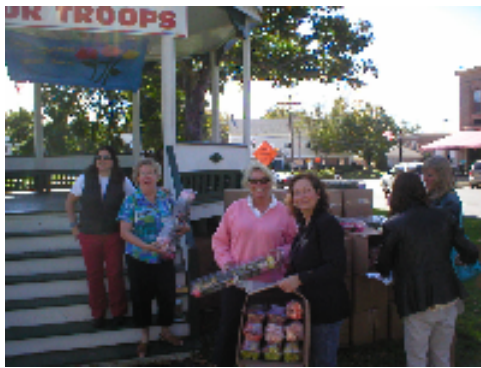
Some of our crew, awaiting customers.